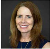
Patty Monahan Commissioner, California Energy Commission

© ChargePoint, Inc. All rights reserved.