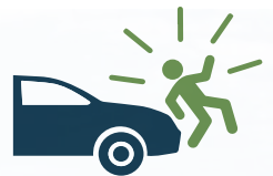
Updates collision data and areas of CONCERN