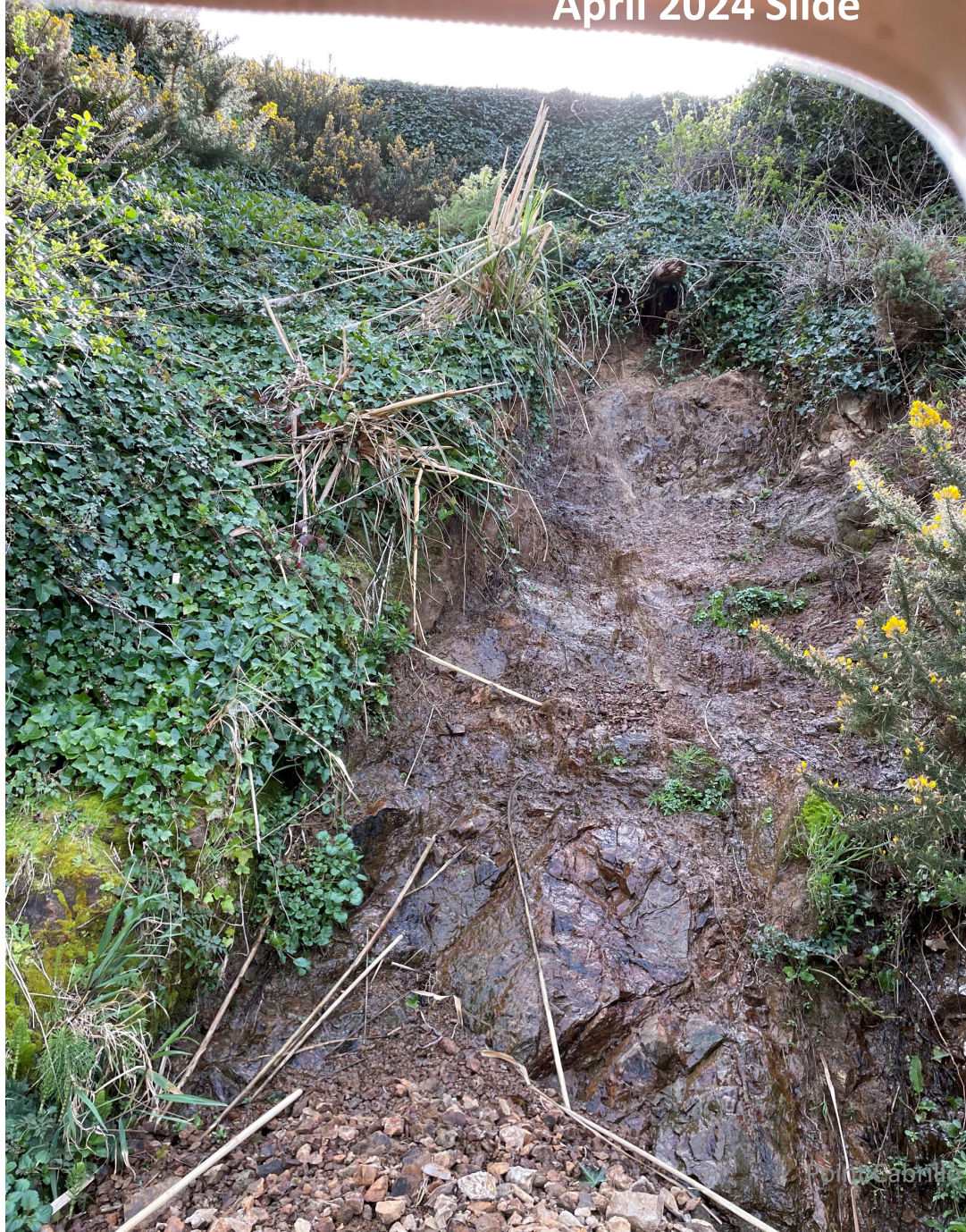
April 2024 Slide