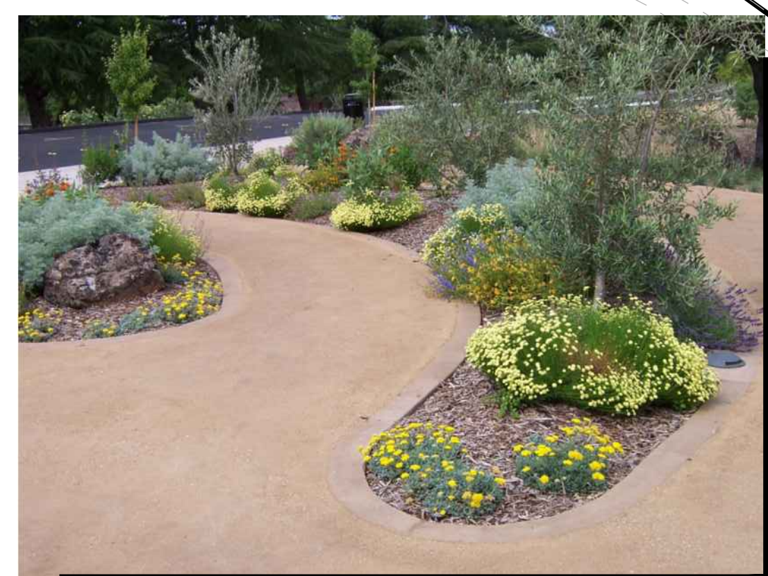
Decomposed Granite Pathway