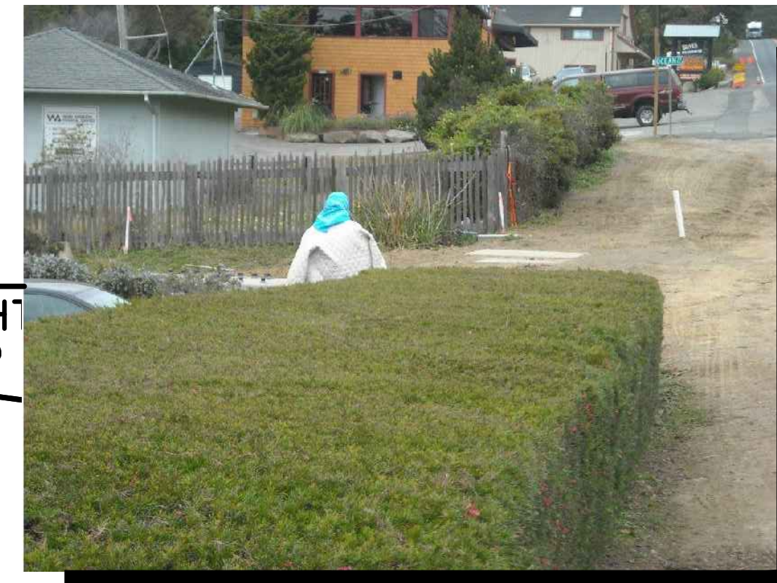
Hedgerow along Highway 1